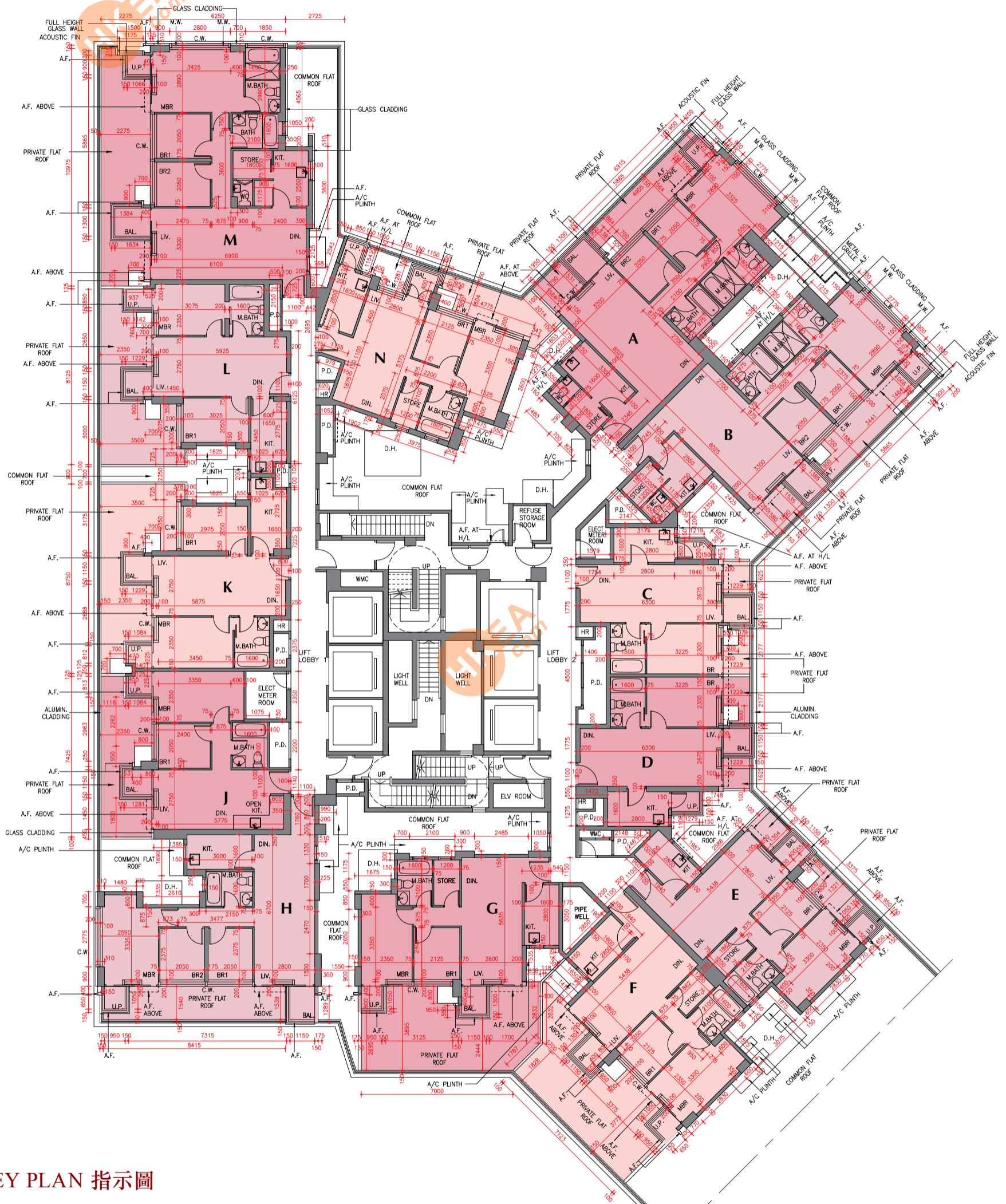
KEY PLAN 指示圖