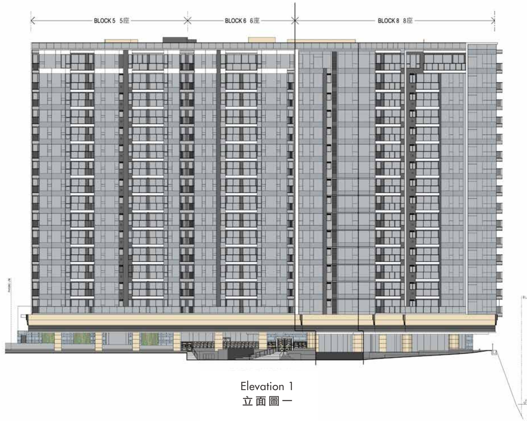
Elevation 1 立面圖一

Authorized person for the Phase certified that the elevations shown on these elevation plans: 1. are prepared on the basis of the approved building plans for the Phase as of 16 January 2019; and 2. are in general accordance with the outward appearance of the Phase.