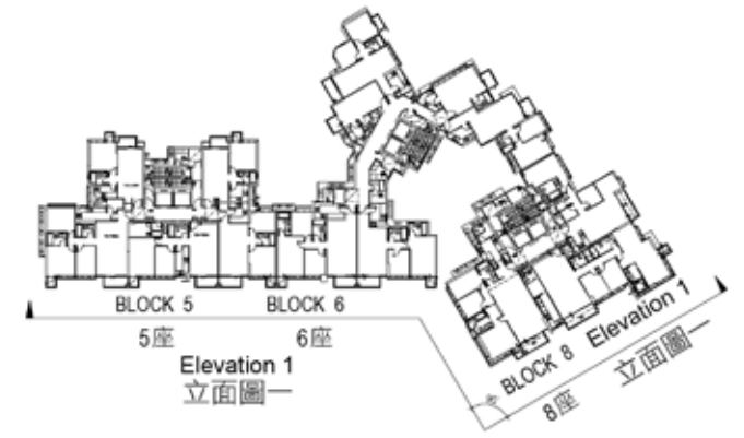
Key Plan 索引圖