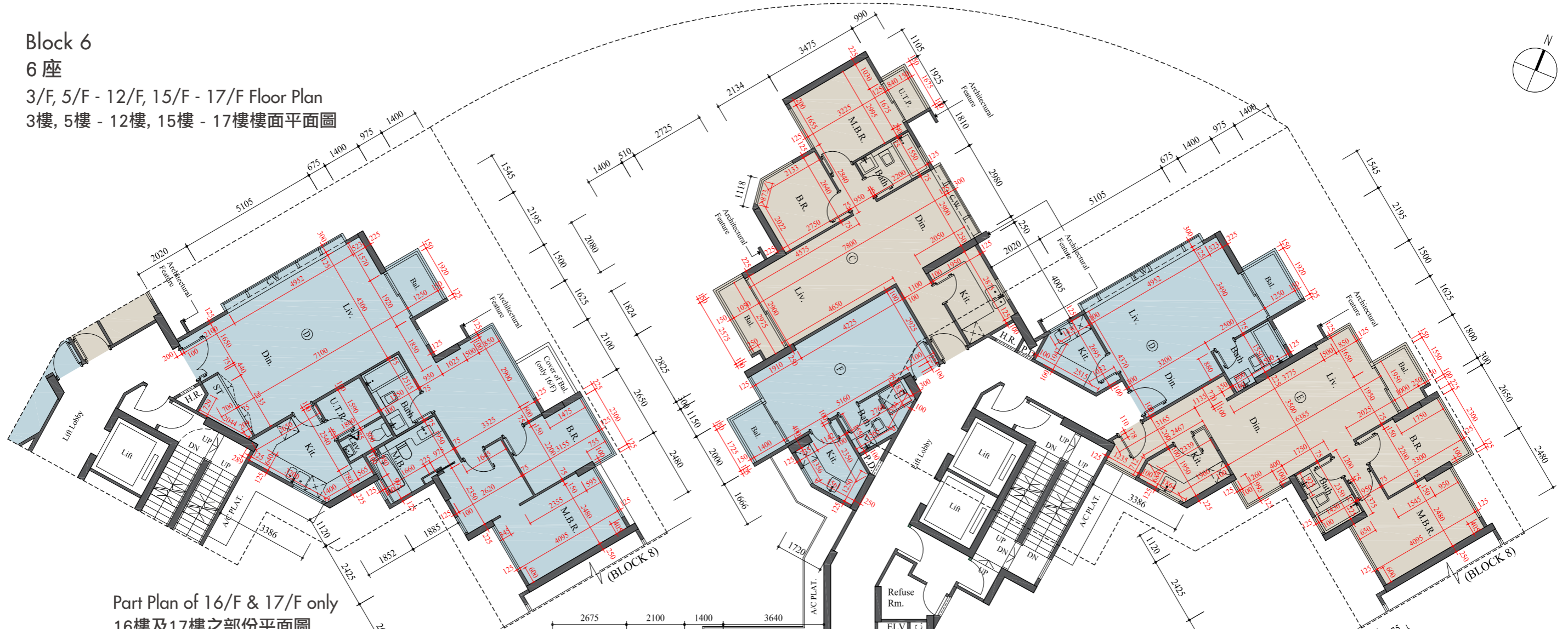
Part Plan of 16/F & 17/F only 16樓及17樓之部份平面圖