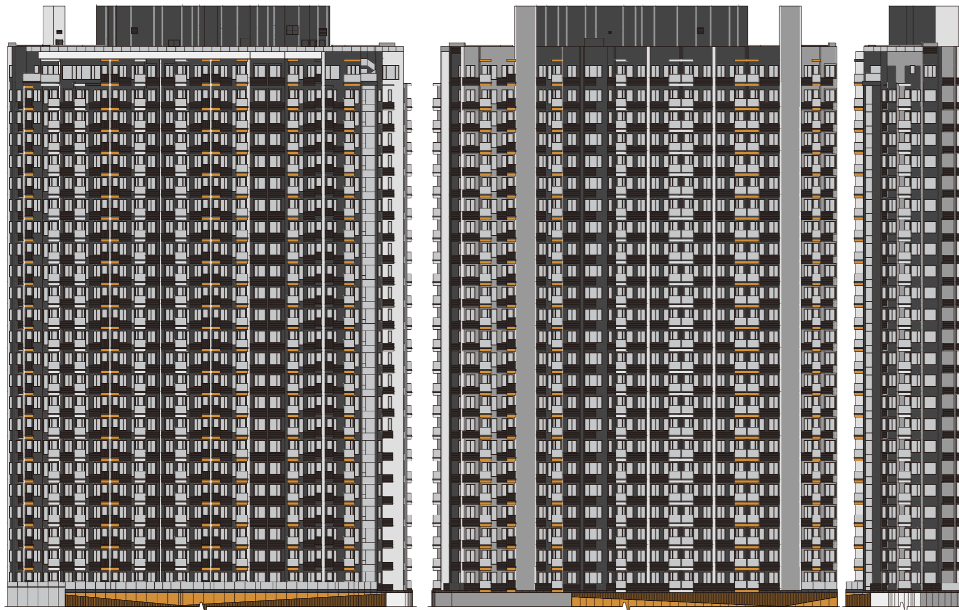
ELEVATION PLAN A 立面圖 A