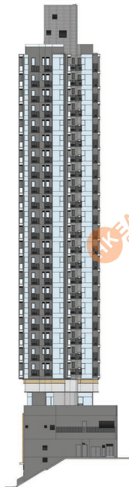
ELEVATION B 立面圖 B