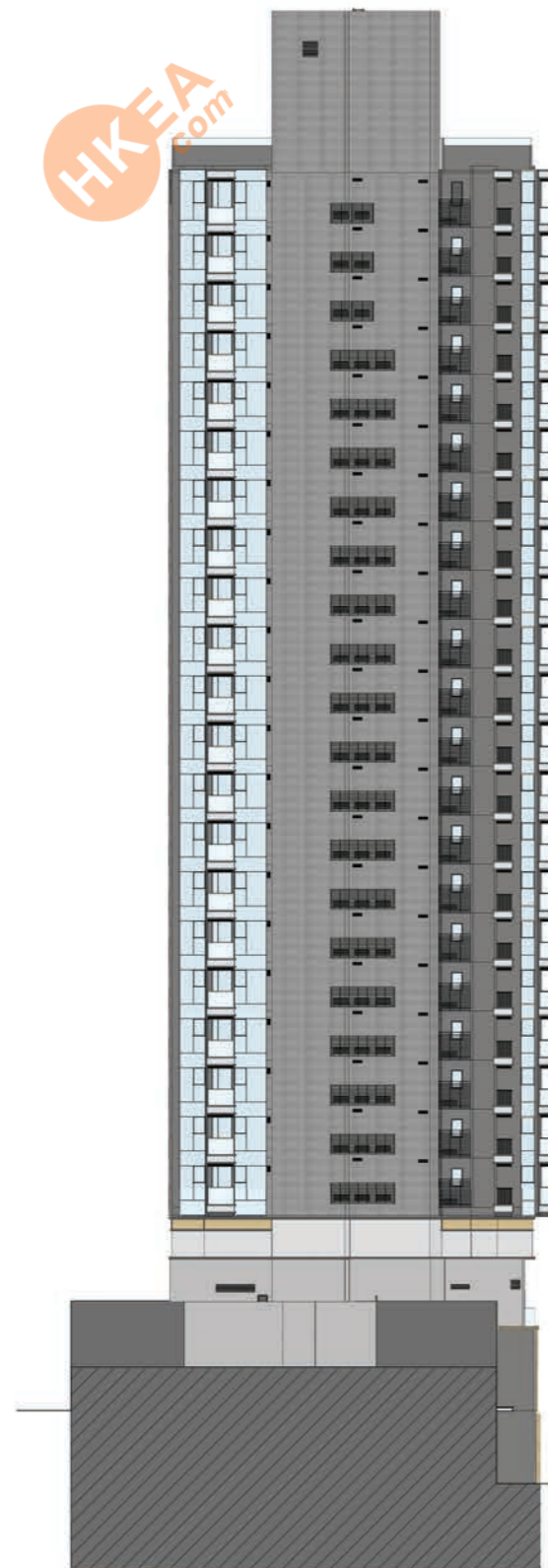
ELEVATION C 立面圖 C