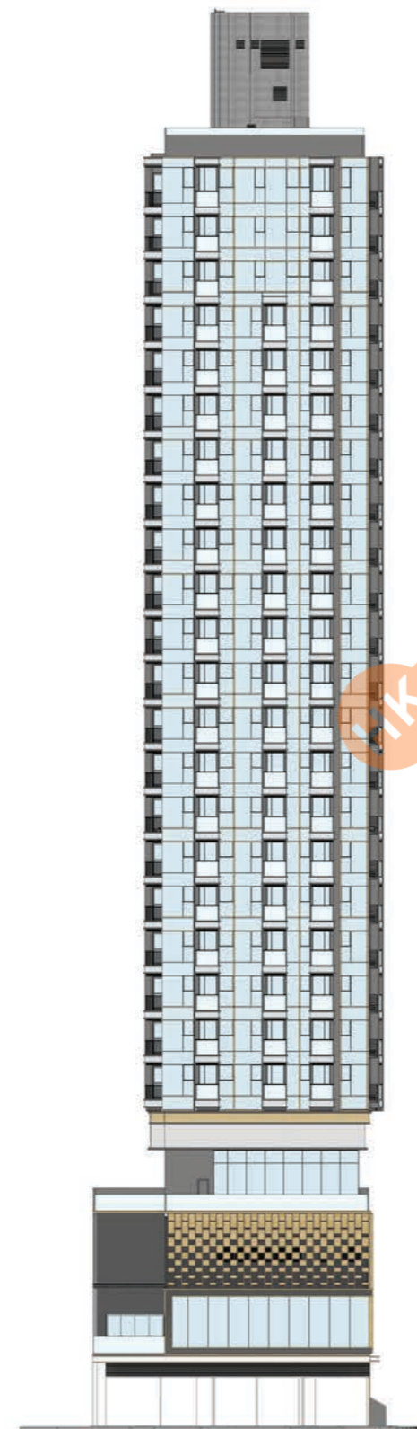
ELEVATION D 立面圖 D