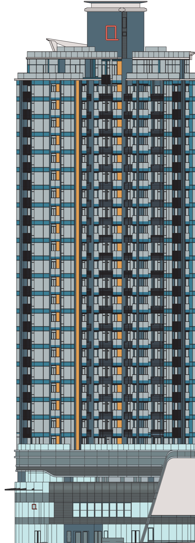
南立面圖 SOUTH ELEVATION