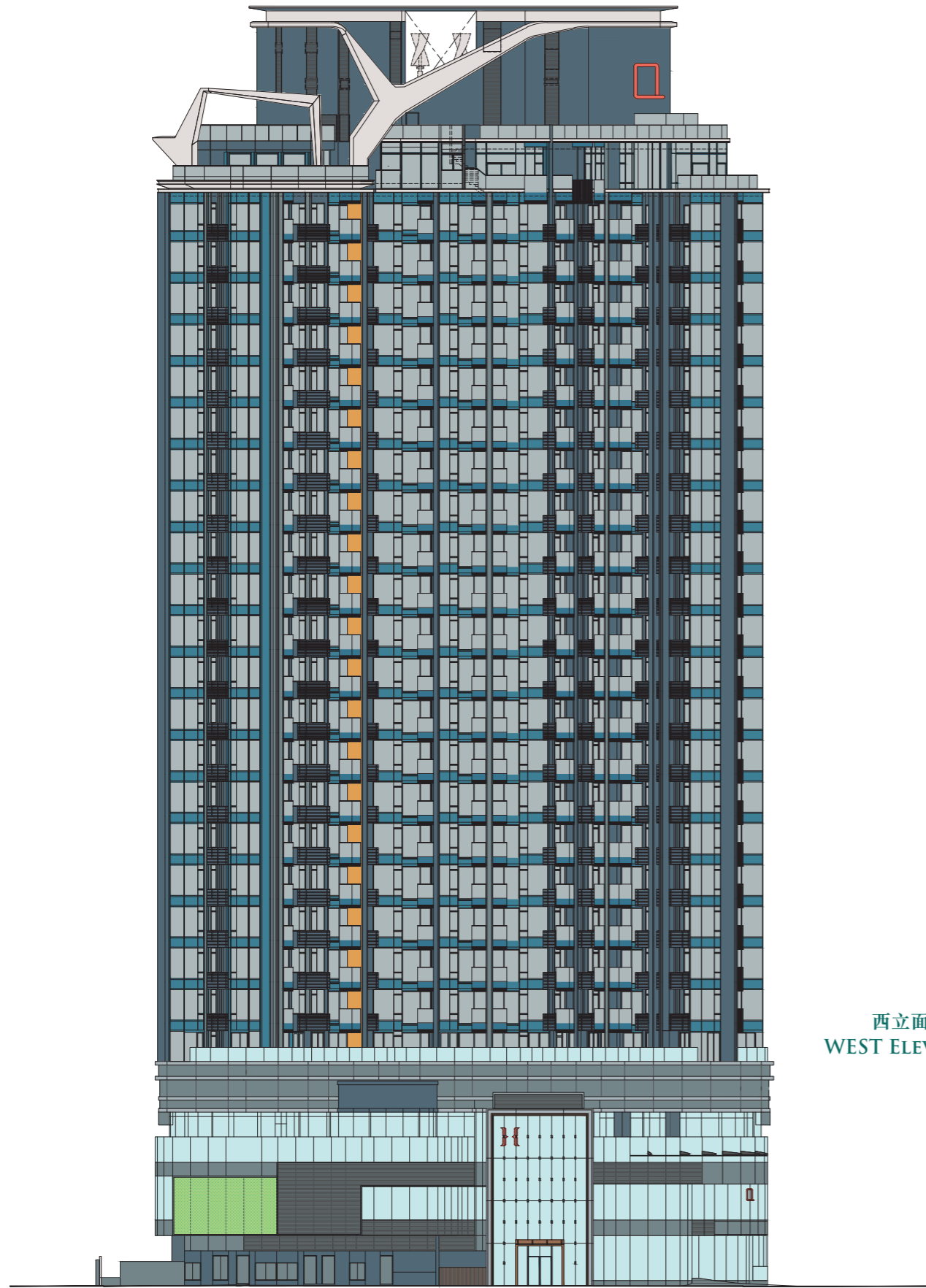
西立面圖 WEST ELEVATION